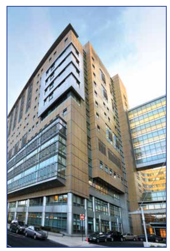
Smilow Cancer Hospital